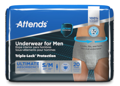
40% savings versus the leading National brand

The Attends® brand has been trusted for 40+ years to provide product solutions for bladder and bowel leakage while enabling Care, Comfort, and Confidence for Veterans and Caregivers. Available throughout the VA Healthcare System.