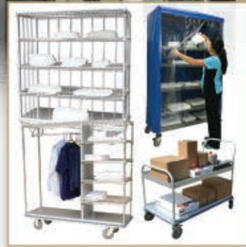
Wire Mobile & Storage Solutions SPD • Receiving • Linen