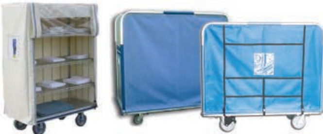
Transparent Solid Front Available.