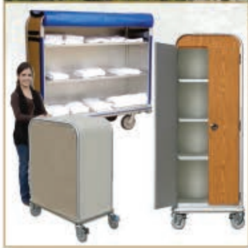
Transport Carts Linen & Supply Variety of Sizes & Customizable