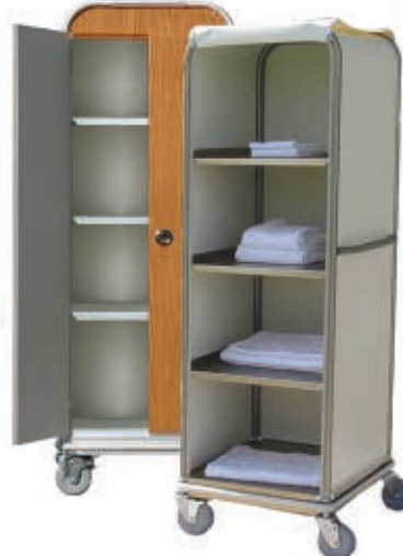
C-Cell Tall Narrow Models Standard Sizes and Custom