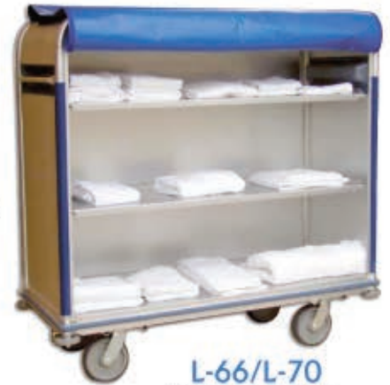
L-66/L-70 8 Standard Sizes & Custom