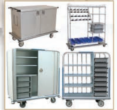
Case Carts • Med/Surge Central Supply Custom Cabinets & Applications

Rolling out Great Carts & Storage Solutions for Health Care Facilities Nationwide