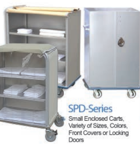
SPD-Series Small Enclosed Carts, Variety of Sizes, Colors, Front Covers or Locking Doors