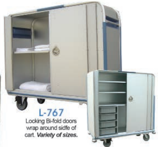
L-767 Locking Bi-fold doors wrap around side of cart. Variety of sizes.

Add Drawers, Pull Out Shelves or Your Ideas.