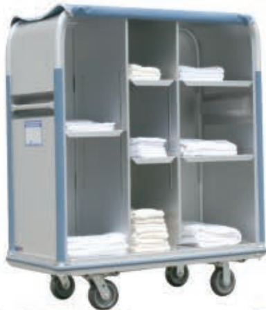
L-77 Multi-Compartment Cart Shelving allows inventory control. Over 10 Standard Sizes.

Rounded corner design and aircraft riveted construction, these models are known for their exceptional strength and durability. All L-Series models are handcrafted from ANODIZED ALUMINUM ALLOY (military and marine specifications).