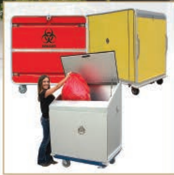
Collection Carts EVS • Dietary • Surgery Recycling • Hampers